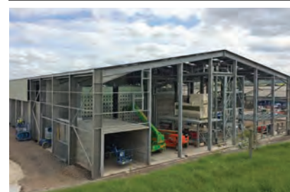
Storage and processing