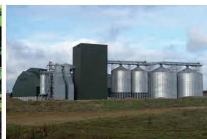
Advanced processing centres