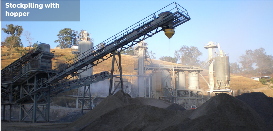
Stockpiling with hopper

By fitting a Dust Suppression Hopper at the loading point where the material is discharged can make a significant difference to the created dust levels and operating environment.