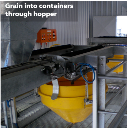
Grain into containers through hopper

Less dust, more visibility, safer operation